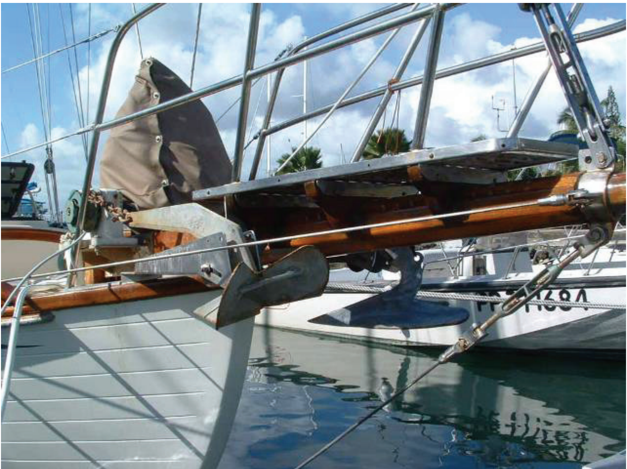
Photo below shows the problem. This is not the default roller set-up, as this owner has had to make a custom solution even for his Delta. A Rocna would likely fit on this arrangement as shown, and would certainly fit if this system was custom built with a Rocna in mind. It is however still not ideal as the anchor can foul the bob-stay as it is lowered and raised, and the chain will also foul the bob-stay at anchor.

The Rocna has an additional complication with the rollbar, but the existing roller position as depicted in provided diagram is bad for any anchor type, with the whisker-stay directly underneath. A CQR, Delta, or Bruce will become fouled. The chain will also strike the stay when running.